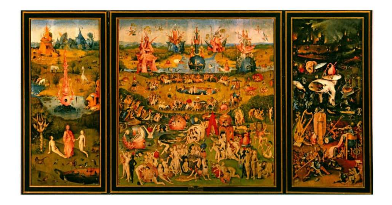
The Garden of Earthly Delights 1500–1505 Hieronymus Bosch, c.1450–1516 (Creation/Garden of Earthly Delights/Hell) Oil, grisaille on wooden panel 220 × 389 cm (87 × 153 in.) Museo Nacional Del Prado, Madrid

Grotesque was able to shock; for example when one type of entity, say a machine, was found germinating or even erupting in a biological form. By mimicking the human body, this machinic element caused a feeling of panic; it threatened one's views of the strict boundaries operative in the world. Such hybridisations no longer confound or displease; instead, they reaffirm the dynamism of a world in which new and radical fusions are expected.