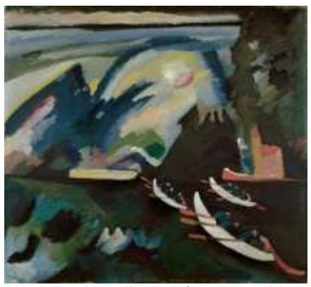
Wassily Kandinsky (1866 – 1944) 'Boat Trip (Lake), 1910, Oil on canvas, 98 x 105cm, St Petersburg, Sataatliche Ermitage

AB: This apocalypse of course is not just an apocalypse that takes place somewhere but it can also refer to the apocalypse of the mind. When certain ideas crumble and fall apart, simultaneously there is a revelation.