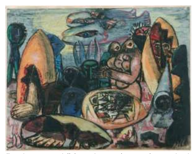
"Frühe Mensch" (Eearly man) 1939 (reworked 1947/48). Watercolour, gouache and pen and ink on paper, 49.8 x 64.5 cm. Max Beckmann (1884 – 1950)

BG: Its an interesting tradition. But I think that tradition is almost, or mostly, lost here. In a very strange way, if you look at this tradition it's both Beckmann and early Kandinsky, it's kind of Nordic, literary, reflexive, and cruel in a certain way, because of metamorphosis and destruction. Americans are perhaps under the spell of the French tradition; the tradition of pleasure. Understanding colour as a source of pleasure; essential pleasure, sexual pleasure. There's a friend of mine in France, he said; 'The surface of the painting should be as the skin of a woman.'