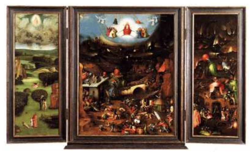
Hieronymus Bosch (c.1450 – 1516), c, 1482, Last Judgement triptych, Oil tempera on oak 164 x 127cm Academy of Fine Arts, Vienna

BG: I see the parallels. The composition made of an abundance of details. It's strange but your paintings remind me of two artists simultaneously; Bosch and Kandinsky.