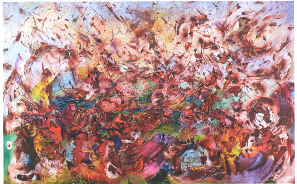
(Below) 'Contact' (2014) (Courtesy the artist/Sperone Westwater Gallery)

Whatever caution he may profess, however, Banisadr clearly relishes the challenge in transcending such cultural boundaries without