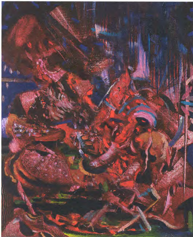
(Below) 'Reflektor' (2014)

earned him considerable plaudits and a fast growing number of admirers.