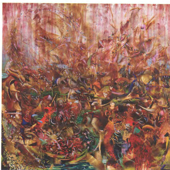
(Above) 'Aleph' (2014) (Left) 'All The Hemispheres' (2014) (All artworks courtesy the artist / Sperone Westwater Gallery)