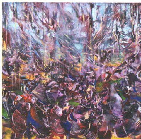
(Right) 'The Scream' (2014)

I meet Banisadr in his small studio in New York's Long Island City, close to the MOMA extension PS1. His work space is meticulously clean and tidy, far from the bohemian paint splattered environment that one might predict from the chaotic vortices of brushstrokes that cover his canvases, the most recent of which stand propped against each wall. It is an early indication that Banisadr is