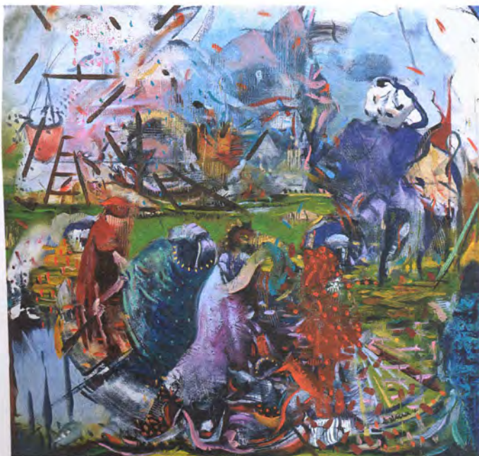
(Left) Alea lacta Est (2013) (Below) 'Motherboard' (2013)

His ability to weave together elements from diverse traditions, making paintings that can communicate to a diverse international audience without sacrificing the distinguishing stamp of his